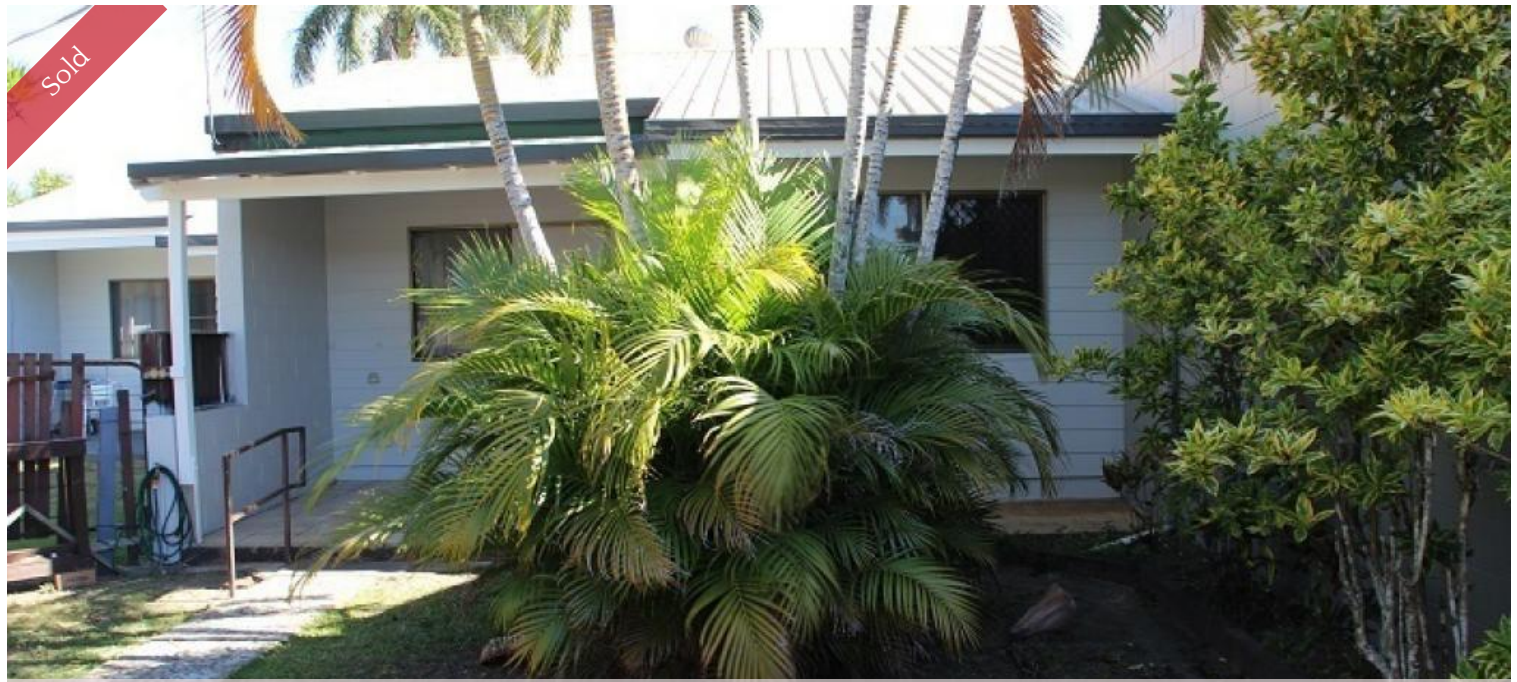
Unit 3, 112 Main St, Proserpine