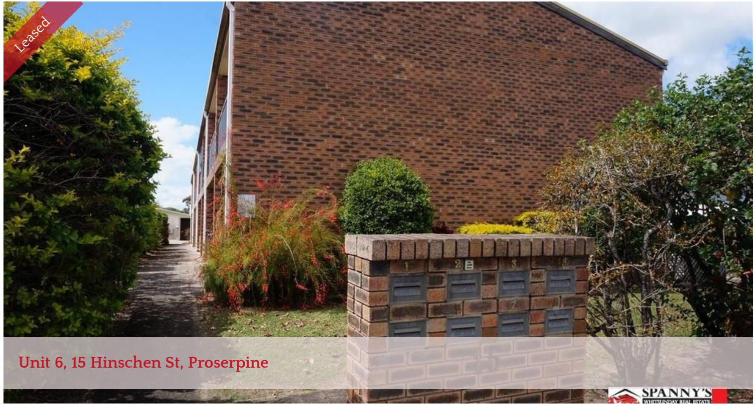
Unit 6, 15 Hinschen St, Proserpine