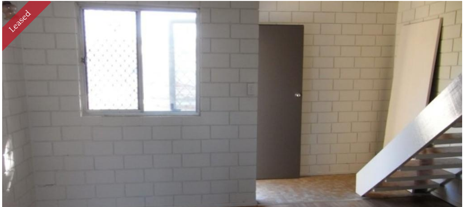
Unit 3, 7 Fuljames St, Proserpine