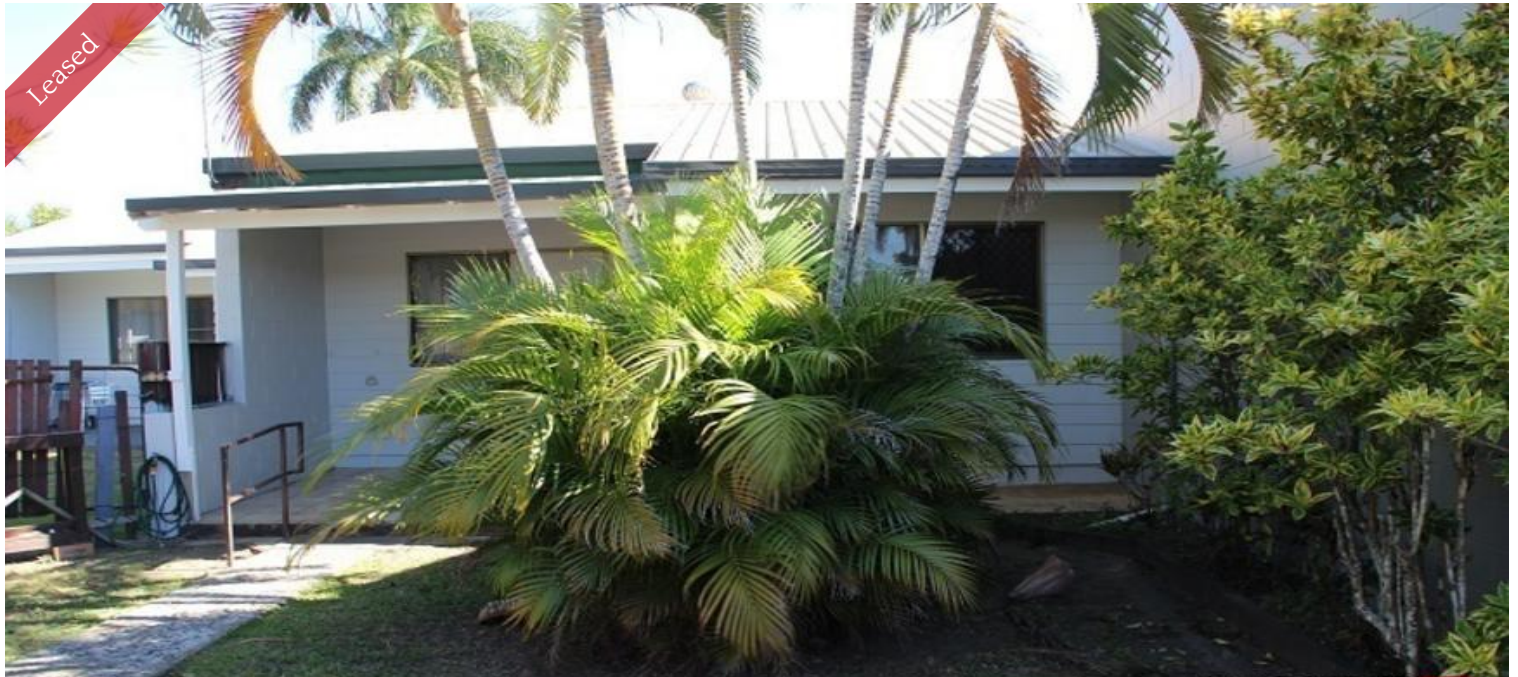
Unit 3, 112 Main St, Proserpine