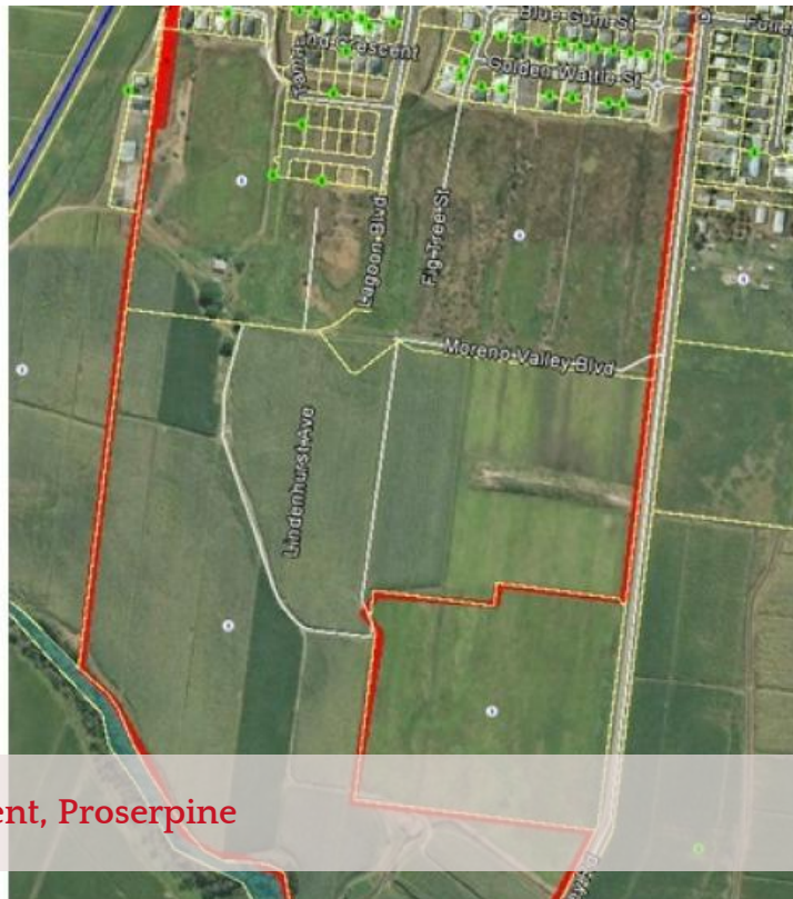
Lot 166 Tamarind Crescent, Proserpine