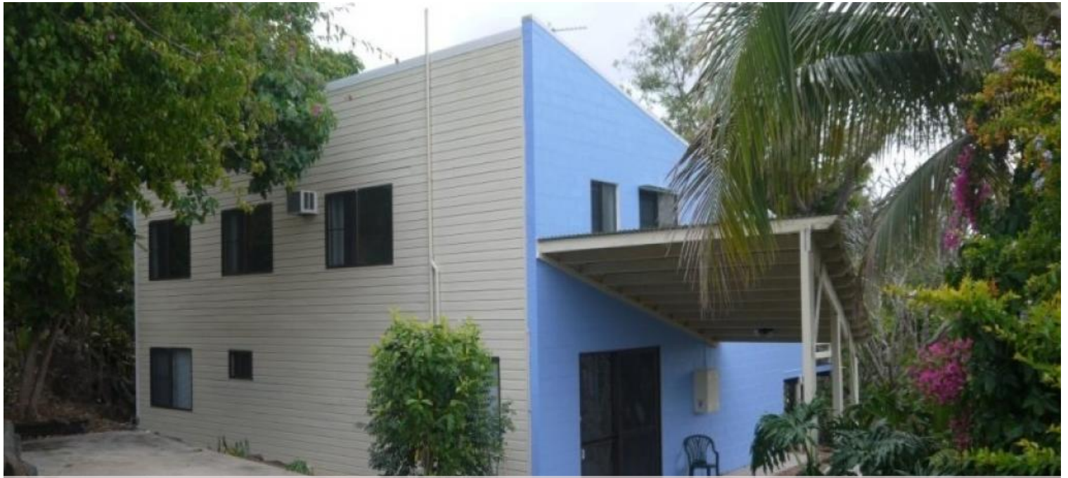
8 Barnes Place, Cannonvale